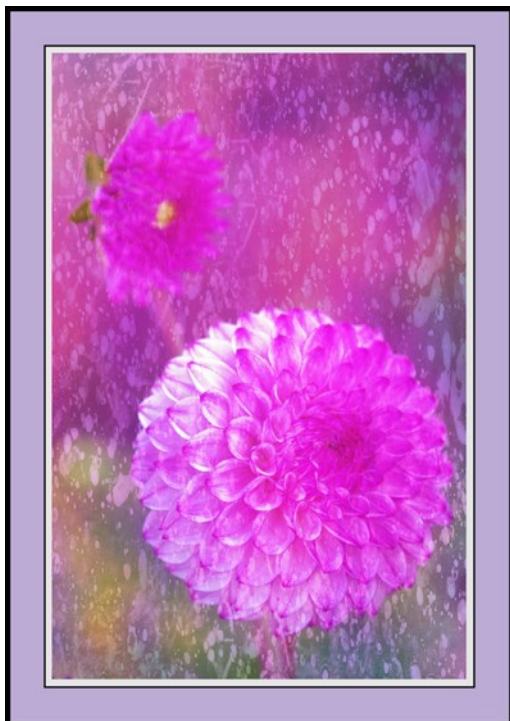
Stuart Frohm 1 st Place Artistic, Category