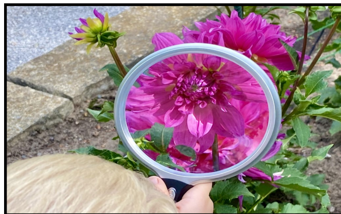
View Dahlias Clearly provides visitors with low vision to magnify dahlia flowers for a better view.