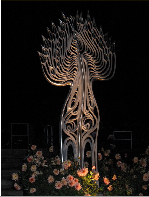
Summer is one of four sculptures found at Dahlia Hill created by Founder Charles Breed

The four “Seasons of Life” sculptures at Dahlia Hill are seven feet tall, cast aluminum pieces designed by Charles Breed. The sculptures are filled with symbols relating to the belief that nature provides us with positive absolutes. Death and taxes are not the only absolutes in life—the equinoxes, solstices and moon phases are cyclic constants that humans have depended on for eons.