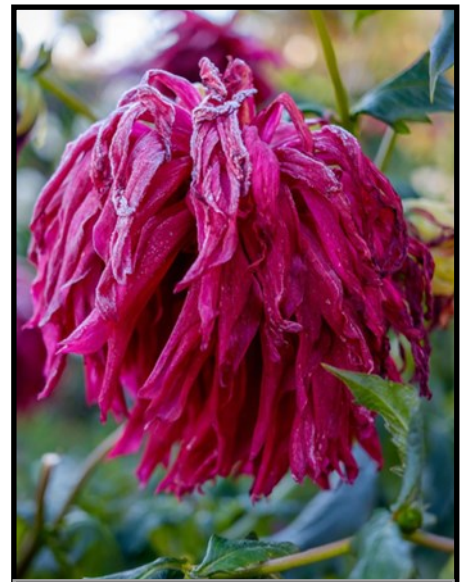
The last frost of 2020 painted the dahlias with new colors.

The concept for the designs evolved from a sketch of the cross section of a flower’s bud that Charles drew in college botany class.