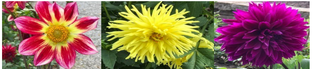
Junk Yard Dog

Dahlias are a garden essential. They begin to bloom as other flowers fade out. They are a magical way to rejoice in the beginning of fall. The Dahlias at Dahlia Hill in Midland, MI reach their peak in September. Here are a few examples of new, brilliant Dahlias photographed last September.