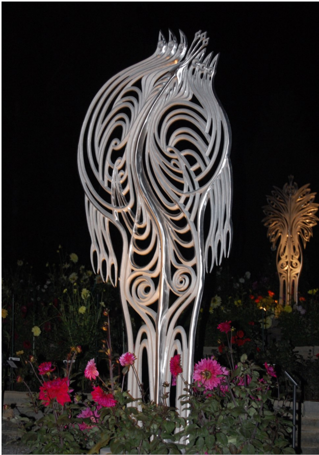
The Winter Sculpture depicts the wilting stage of life .