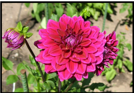
Dahlia 'Boogie Nights'

The September Equinox event is the perfect time to see the blossoms in all of their glory. Remember, Dahlia tubers go on sale each spring so mark down your favorites and put it on your calendar for next spring.