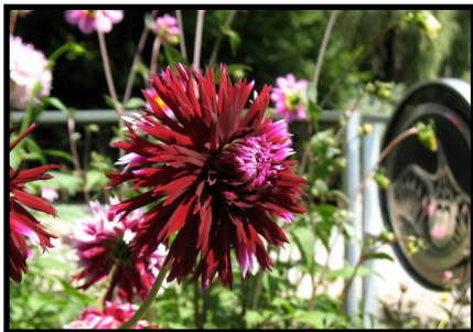
Dahlia 'Aluana Clair-Obscur'

Want to add some particularly fabulous purples to your garden palette? Check out these two new varieties for 2020, 'Aluana Clair-